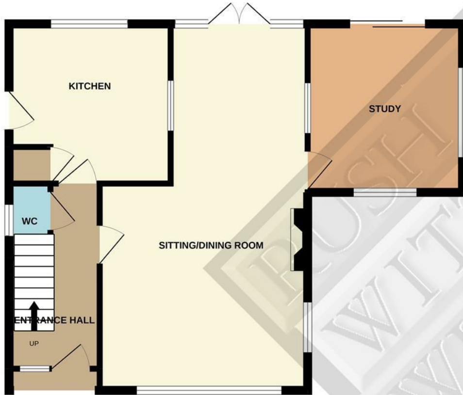
GROUND FLOOR 583 sq.ft. (54.2 sq.m.) approx.