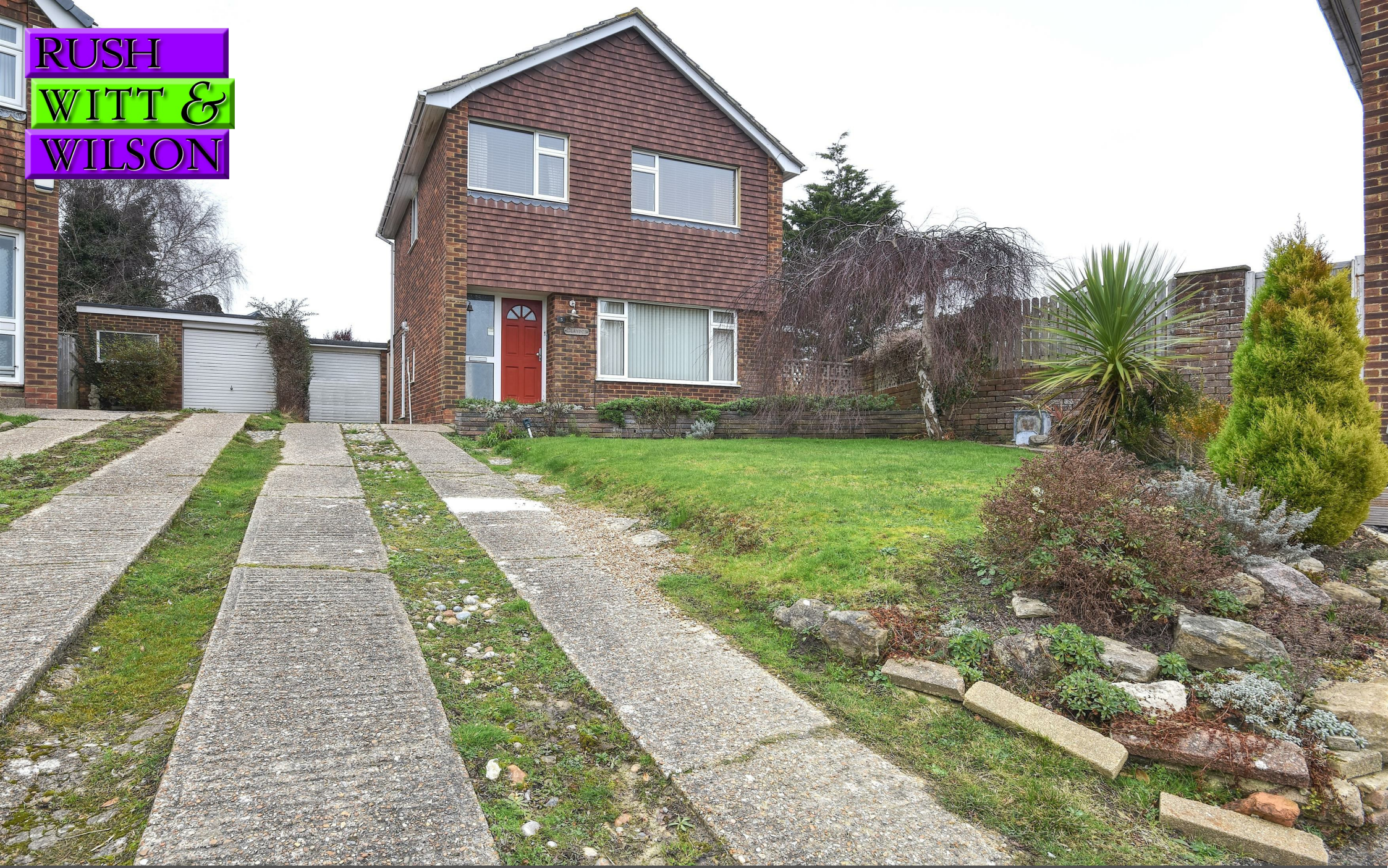
5 Diana Close, Bexhill-On-Sea, East Sussex TN40 2RW £410,000